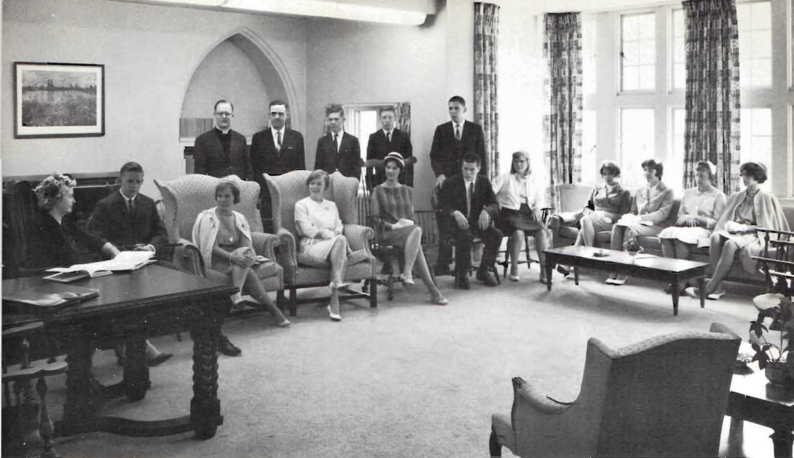
The Senior Highs enjoy the comfort and fellowship of the new Library-Lounge.