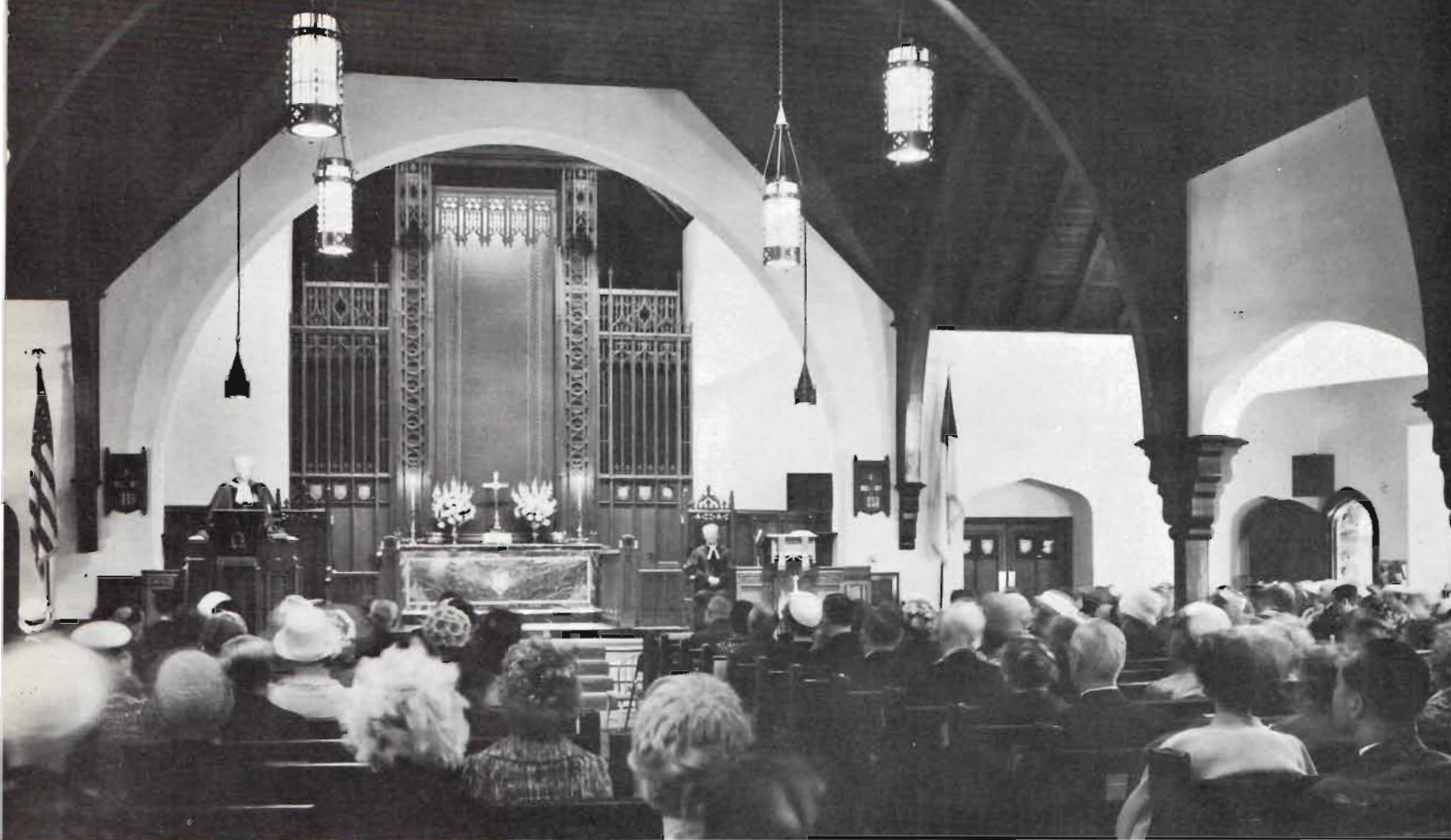
The new double door exit from the Sanctuary affords easy access to the Church House.