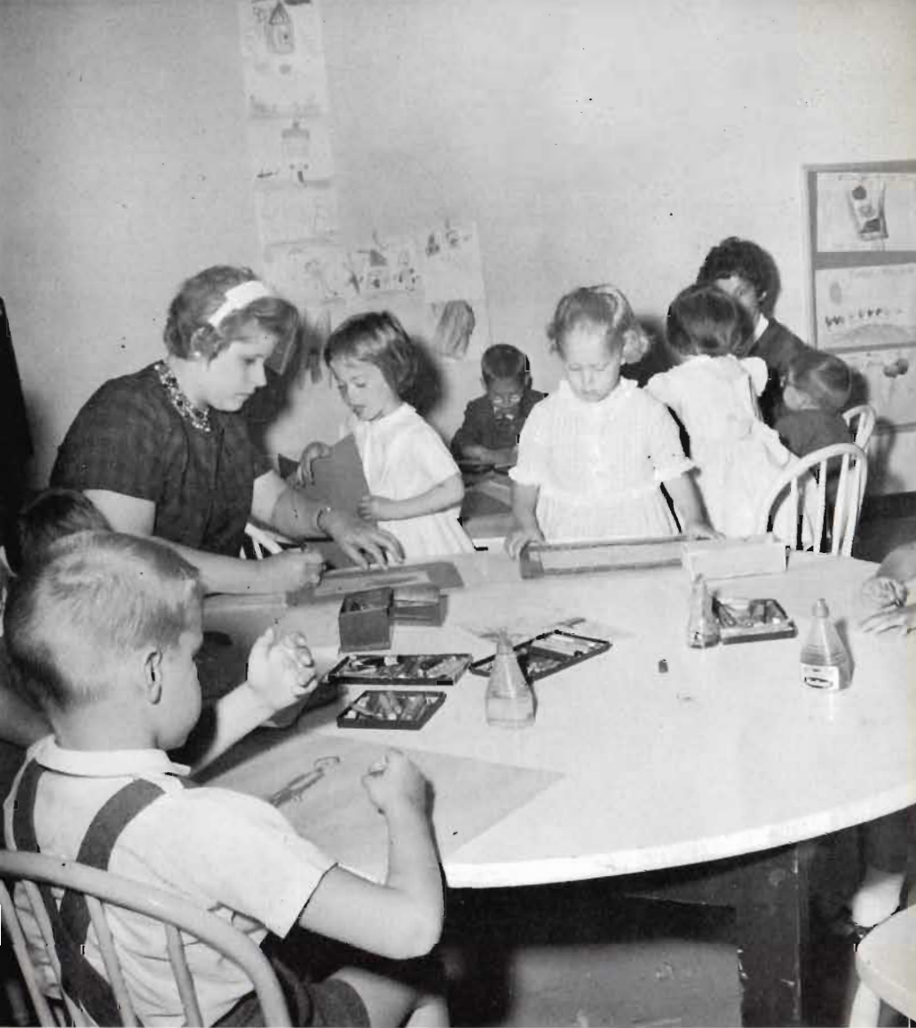
Kindergarten children of the Church School enjoy their new room off the sunken garden.