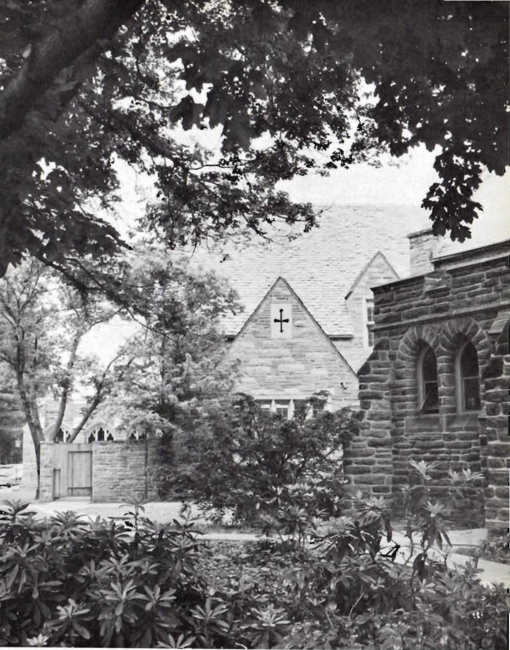
The lovely trees were preserved even to the extent of building the service yard wall around a walnut tree.