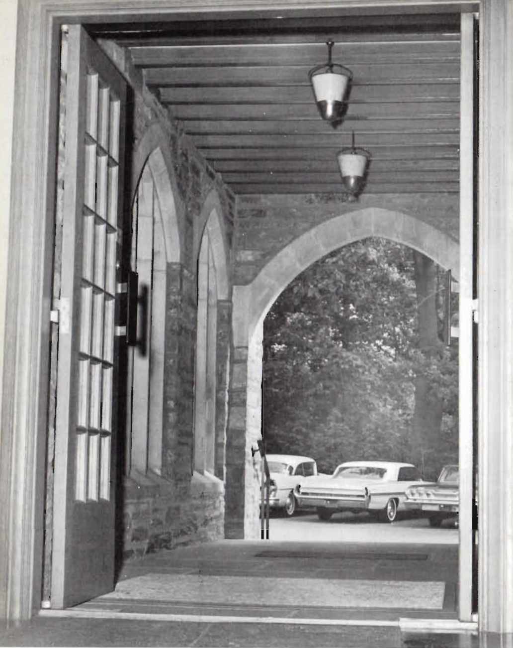
From the inside of the cloister entrance looking out to the new parking lot.