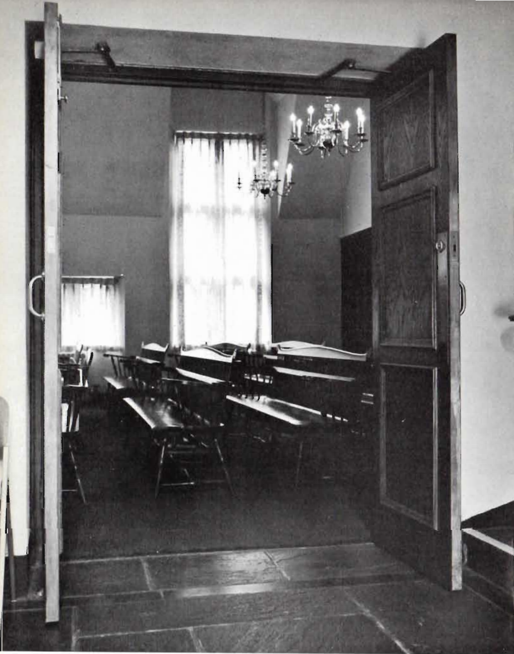
A side view of the new Chapel.