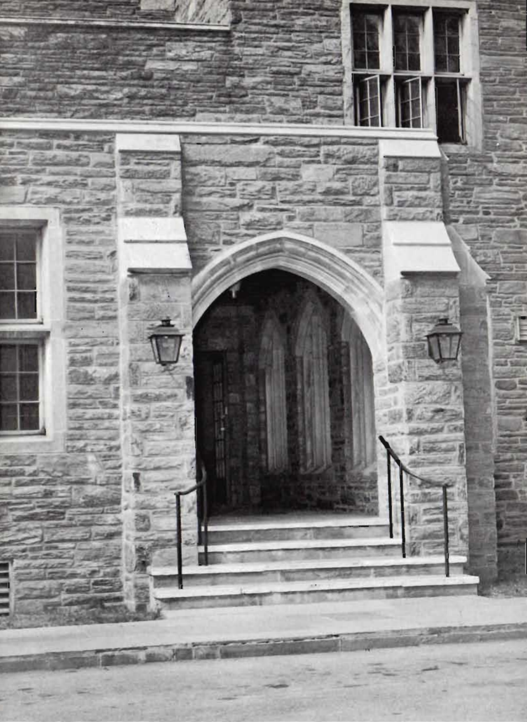
Cloister entrance to the new administration wing.