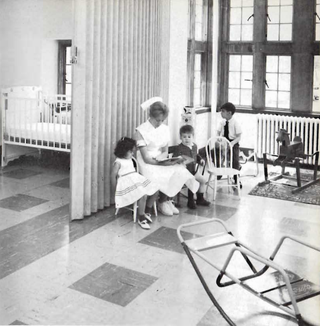
Crib facilities for the little ones and toys for toddlers plus a student nurse make the Nursery facilities complete.