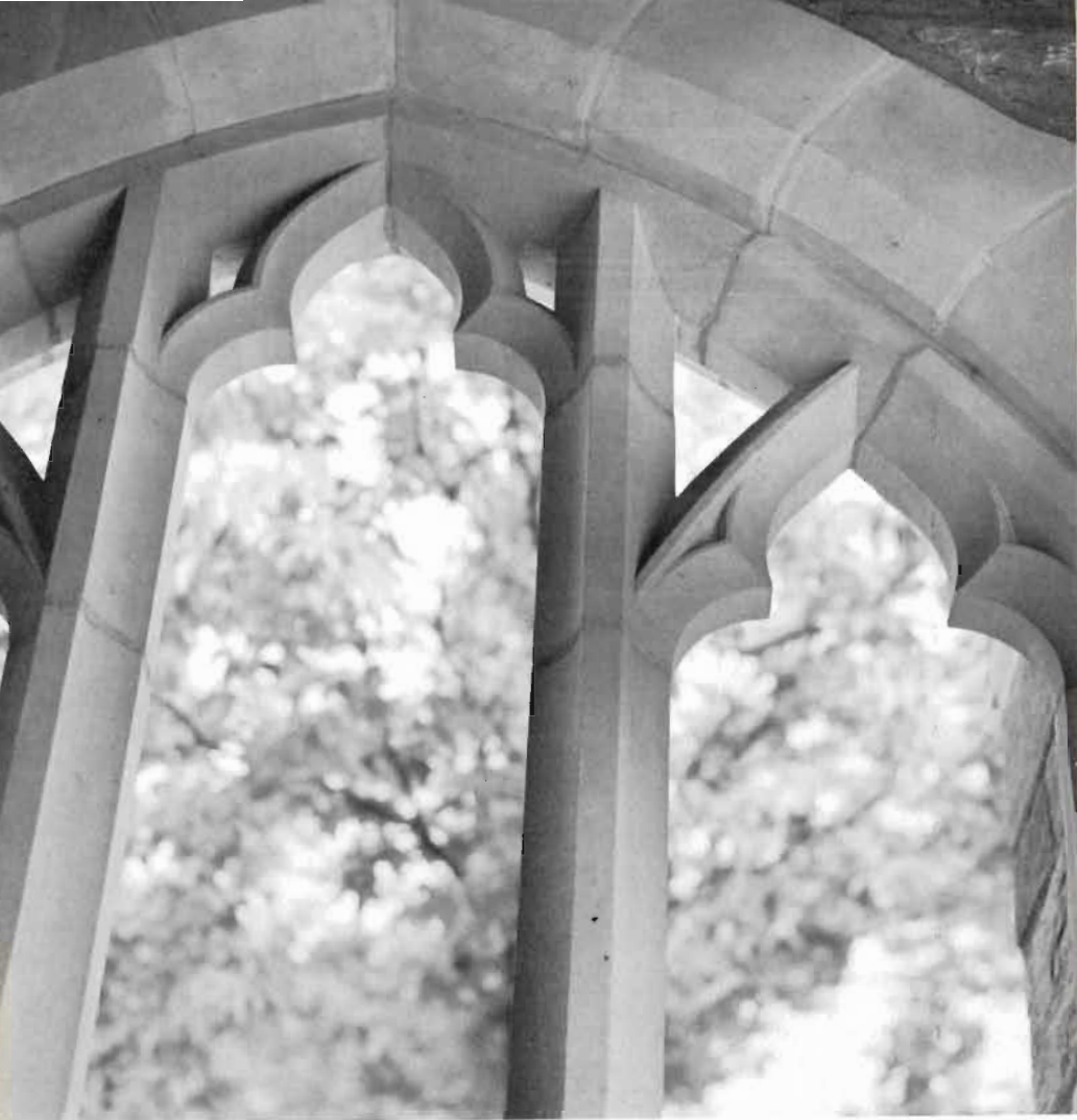
One of the several arches in the cloister entrance.