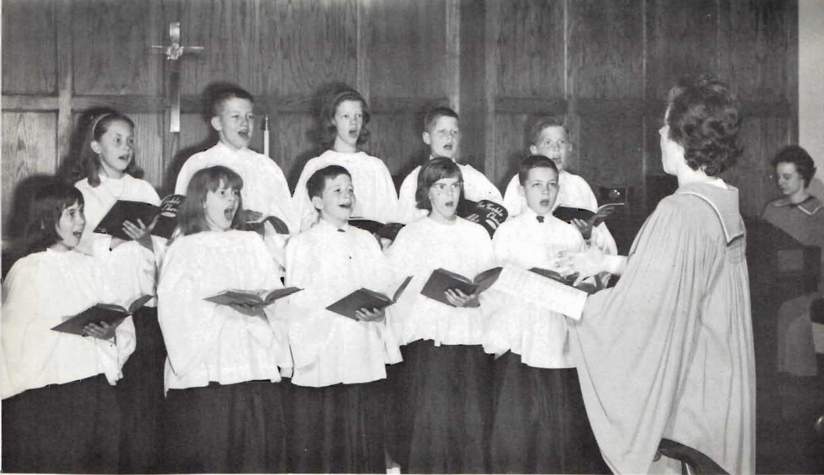
The Junior Choir in dress rehearsal in the new Chapel.