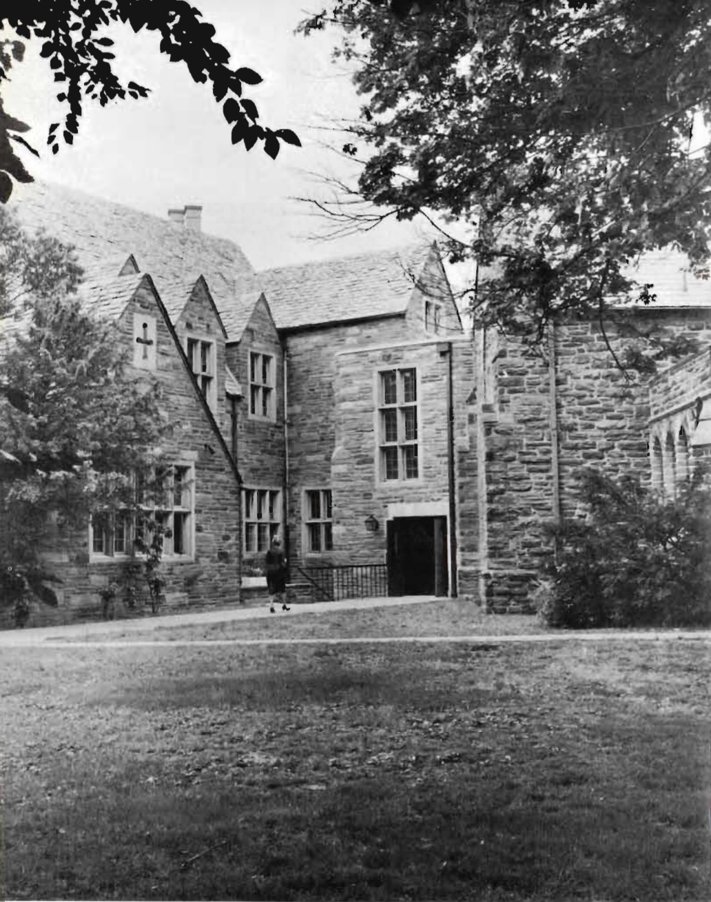
Beautifully matched stone structure joins the two buildings.