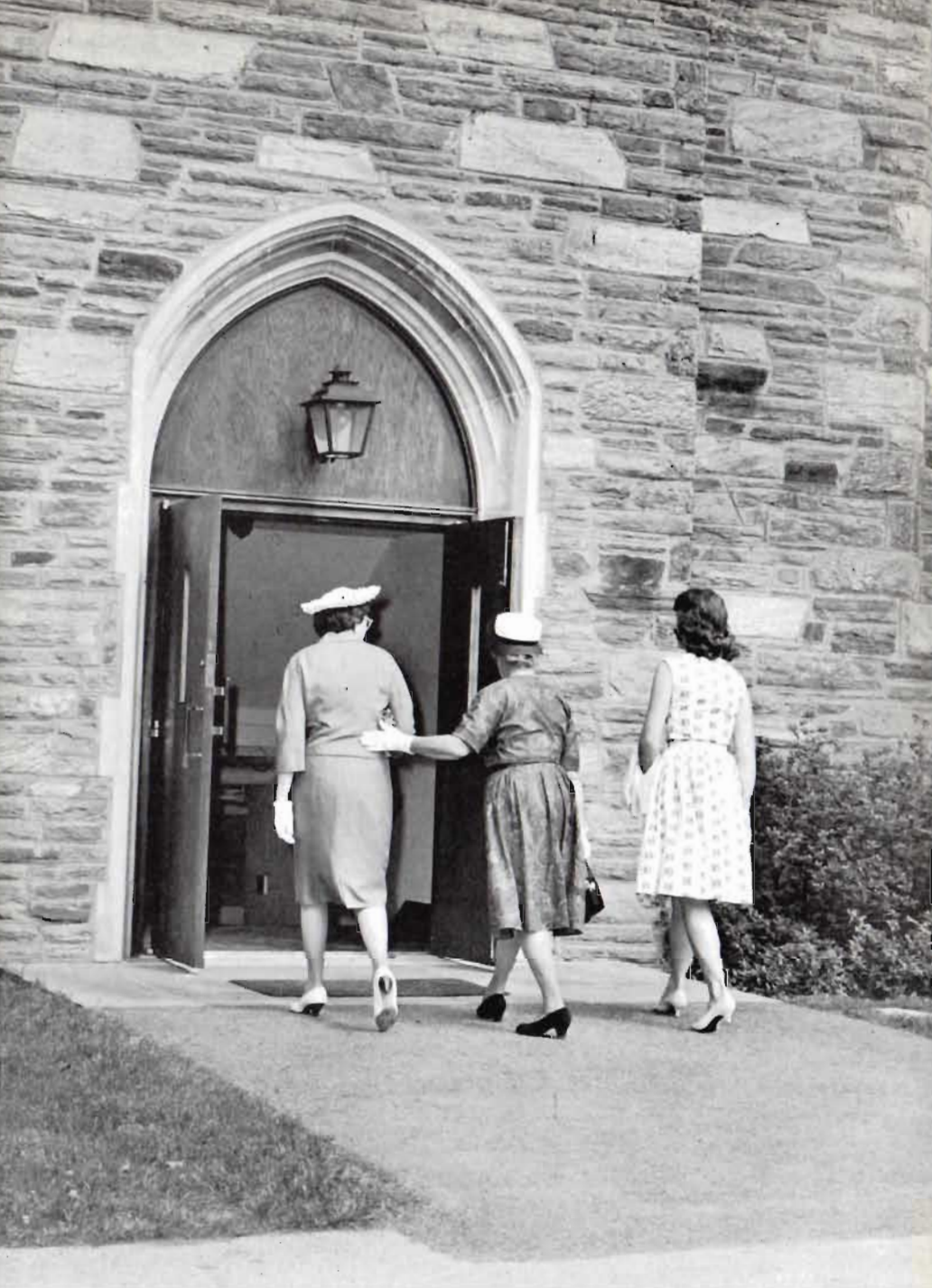
Easy access through new entrance from old parking lot.