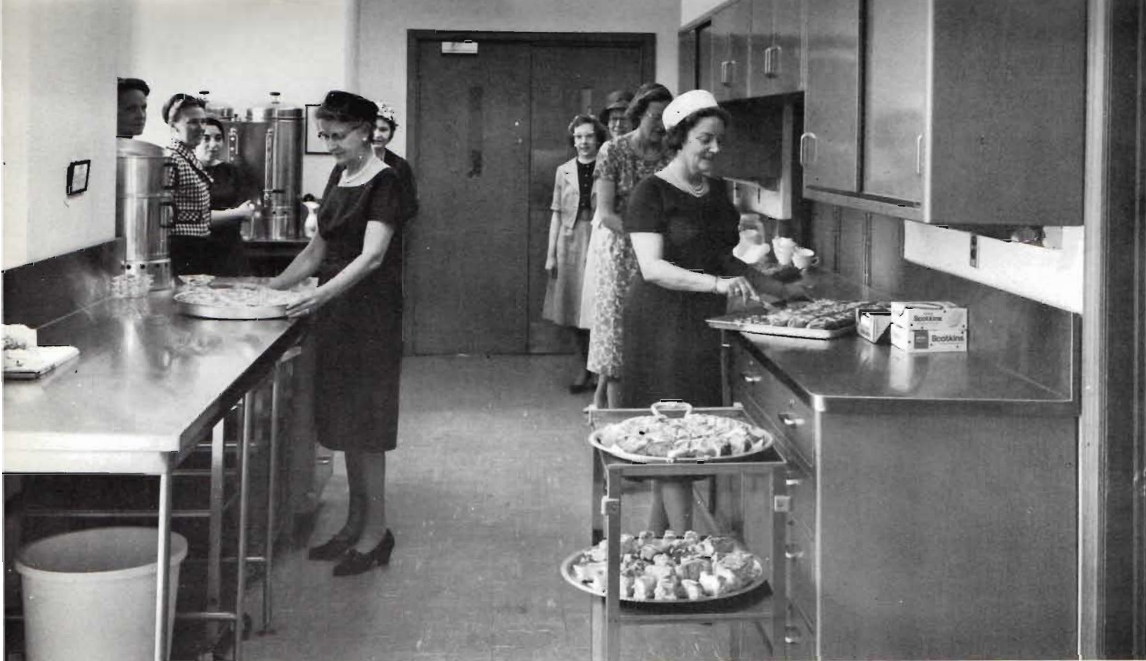
A portion of the new Kitchen is used by our ladies to prepare refreshments for the Coffee Hour each Sunday.