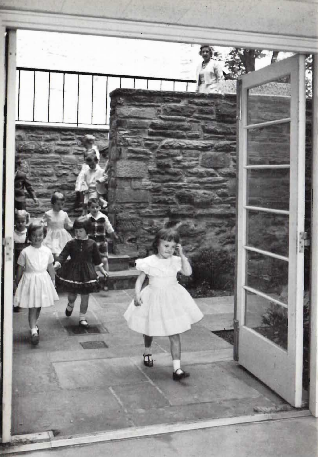
Church School Kindergarten children enter their new Kindergarten Room by way of the sunken garden entrance.