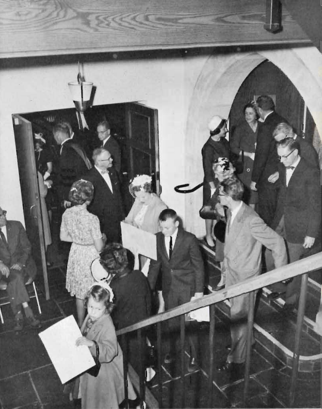
Worshippers leaving the Sanctuary stop to view the new Chapel.